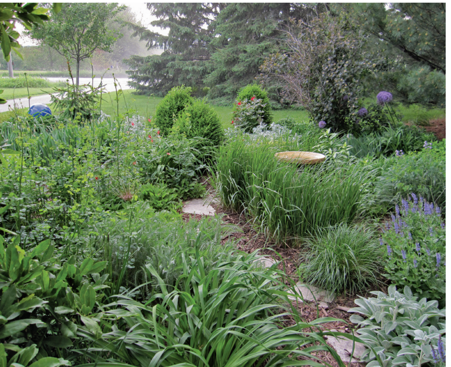
ABOVE: A path leads through the garden toward the road. In spring, Allium, Salvia , columbine ( Aquilegia spp.), a Double Knock Out rose ( Rosa 'Radtko') and blue star are in flower. On the left, meadow rue is about to bloom as it reaches upward. Stepping-stones take us between 'Green Mountain' boxwood. The gray-green of lamb's ear ( Stachys byzantina ) and the green tones of the other foliage create a soothing experience.